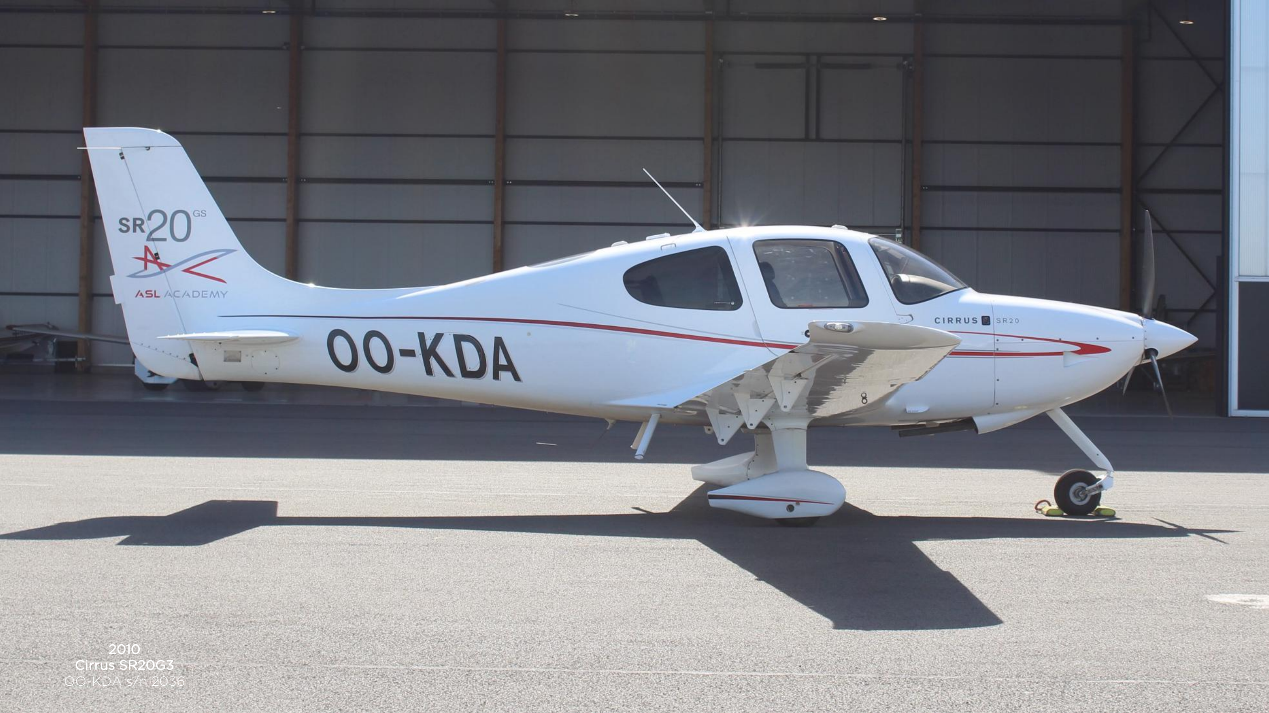
2010 Cirrus SR20G3 OO-KDA s/n 2036