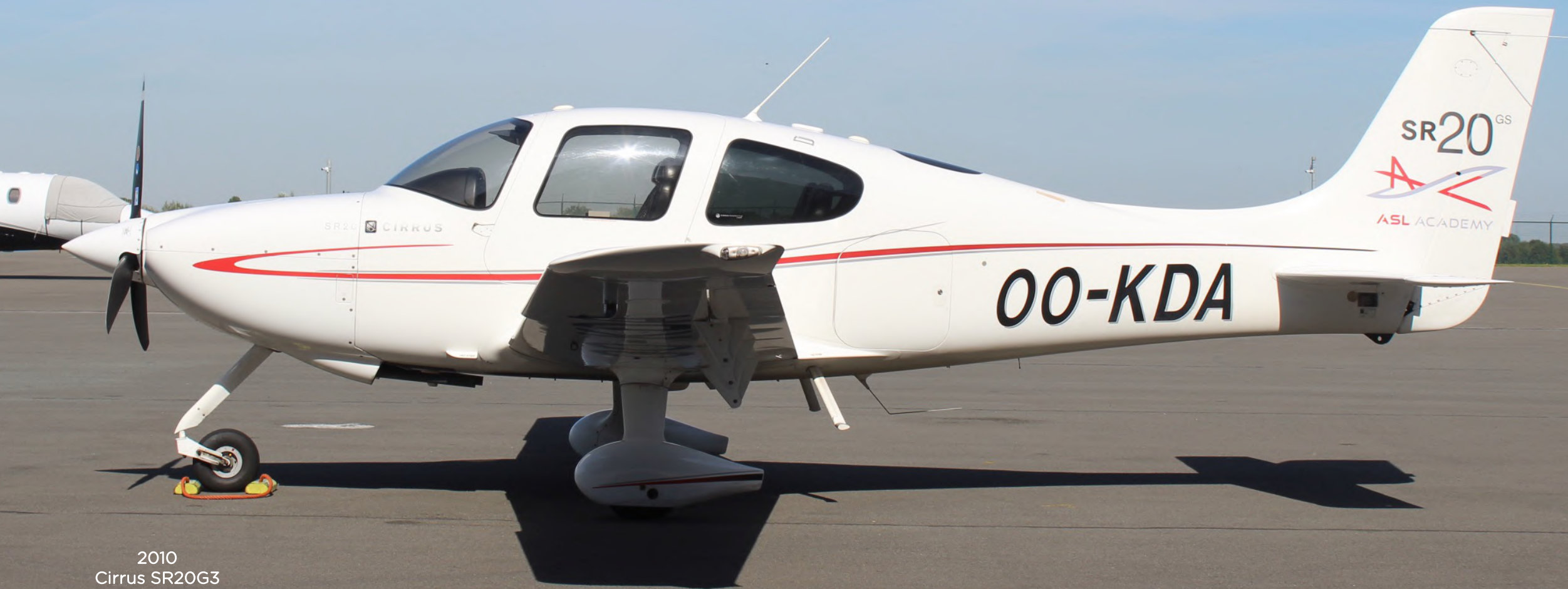
2010 Cirrus SR20G3 OO-KDA s/n 2036