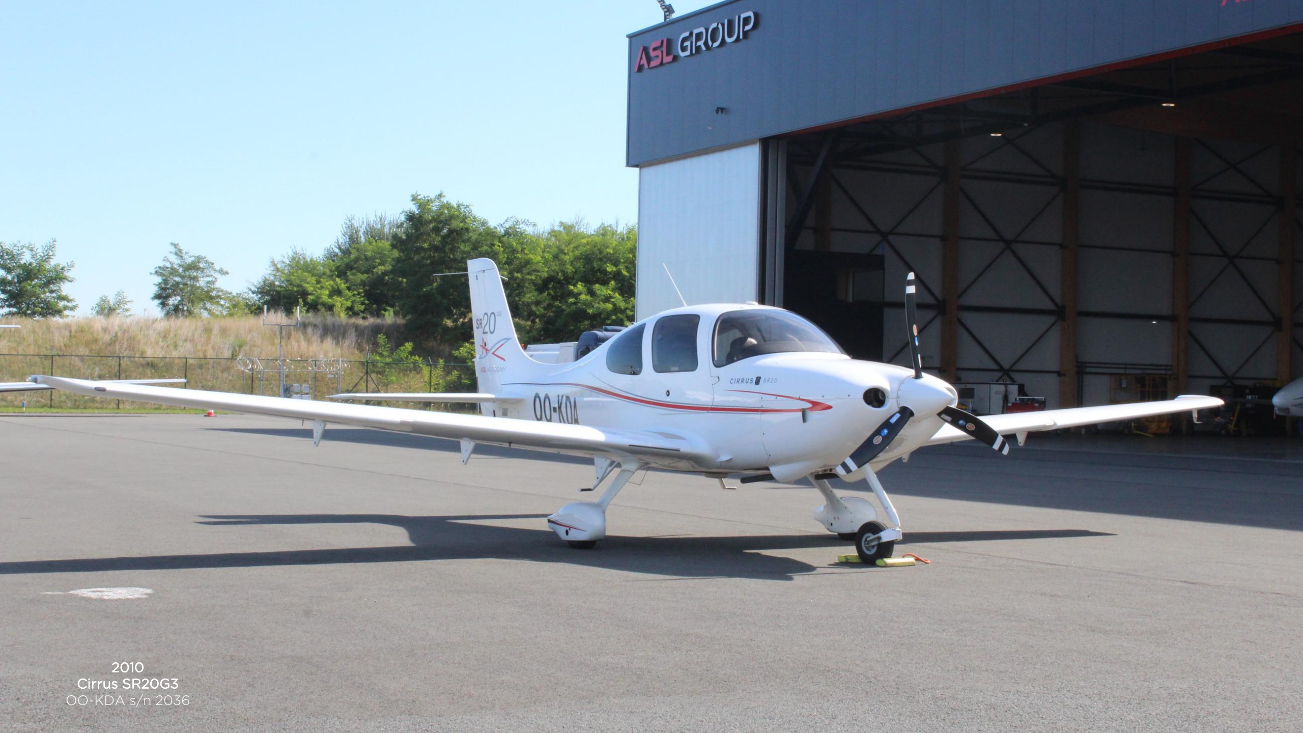
2010 Cirrus SR20G3 OO-KDA s/n 2036