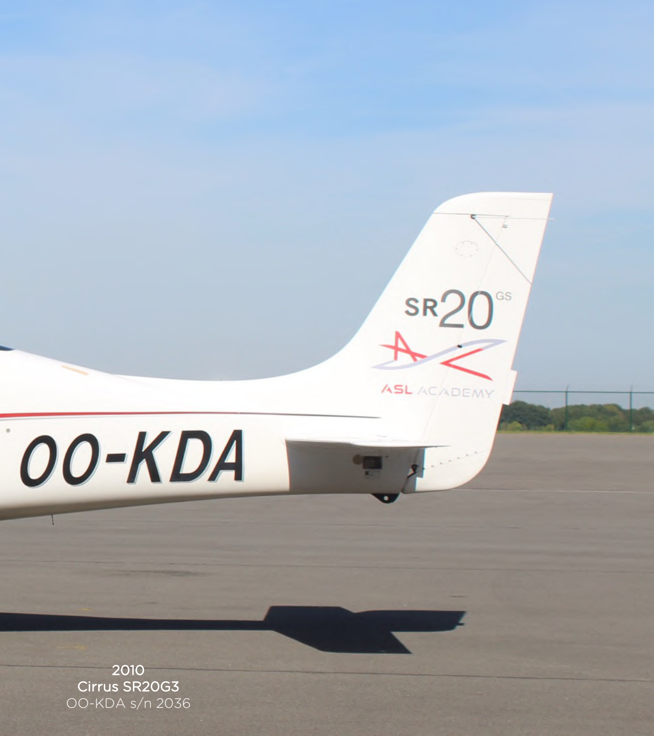
2010 Cirrus SR20G3 OO-KDA s/n 2036