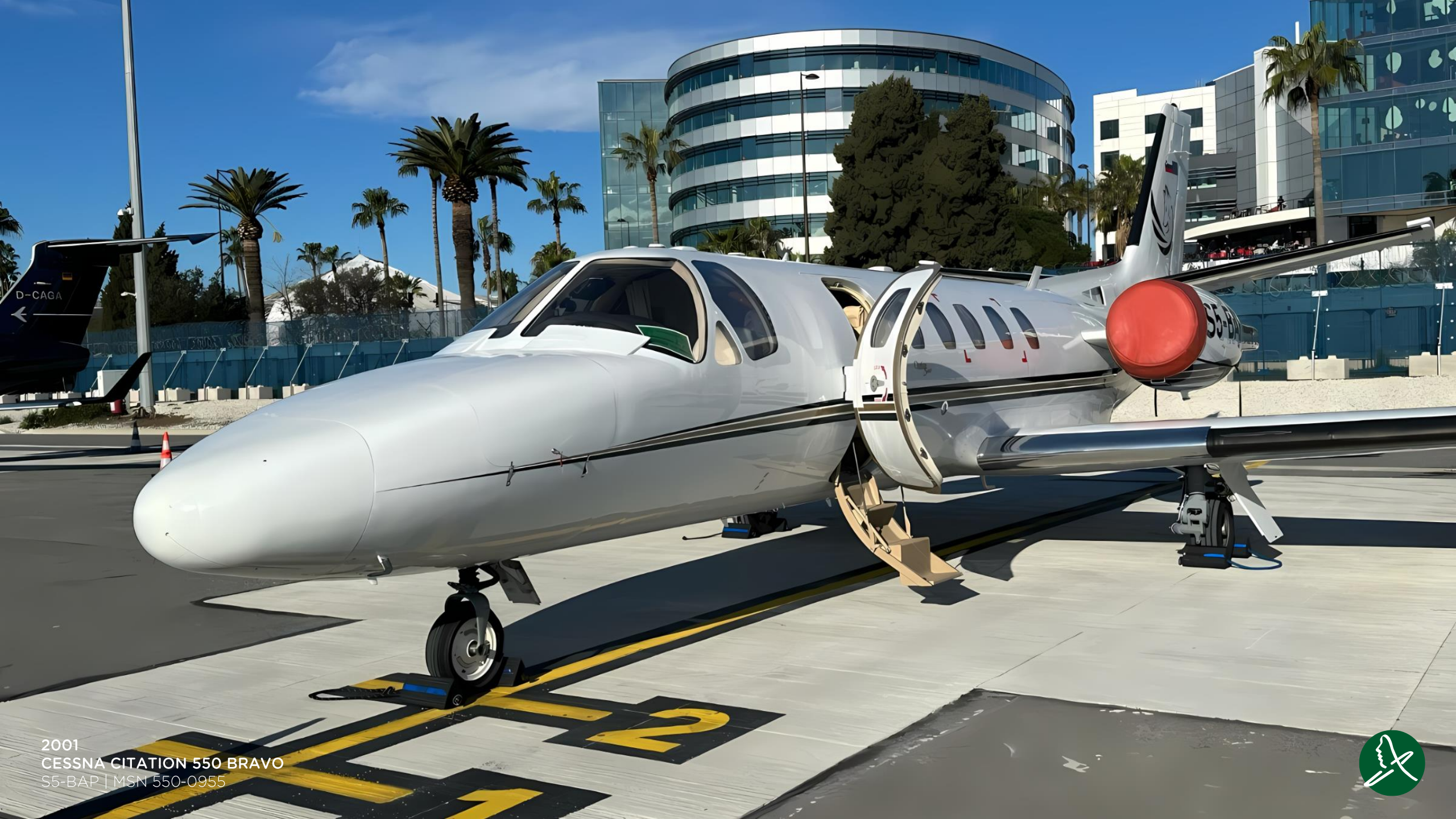
2001 CESSNA CITATION 550 BRAVO S5-BAP | MSN 550-0955