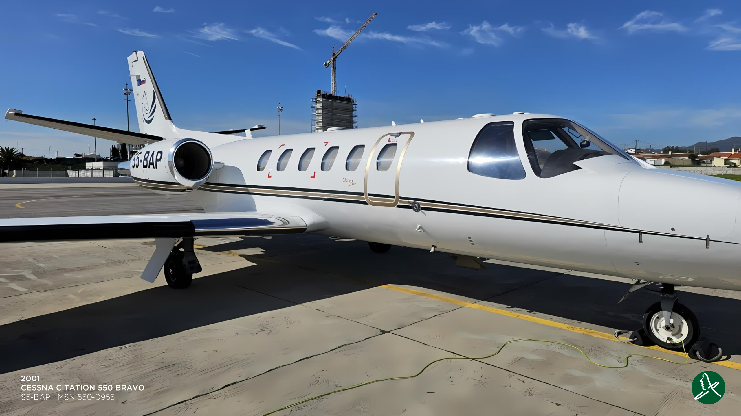
2001 CESSNA CITATION 550 BRAVO S5-BAP | MSN 550-0955