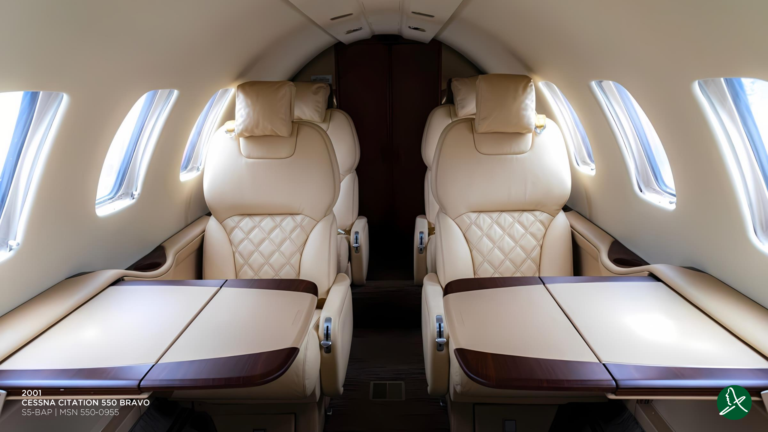
2001 CESSNA CITATION 550 BRAVO S5-BAP | MSN 550-0955