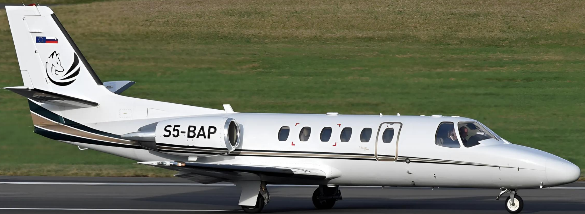
2001 CESSNA CITATION 550 BRAVO S5-BAP | MSN 550-0955