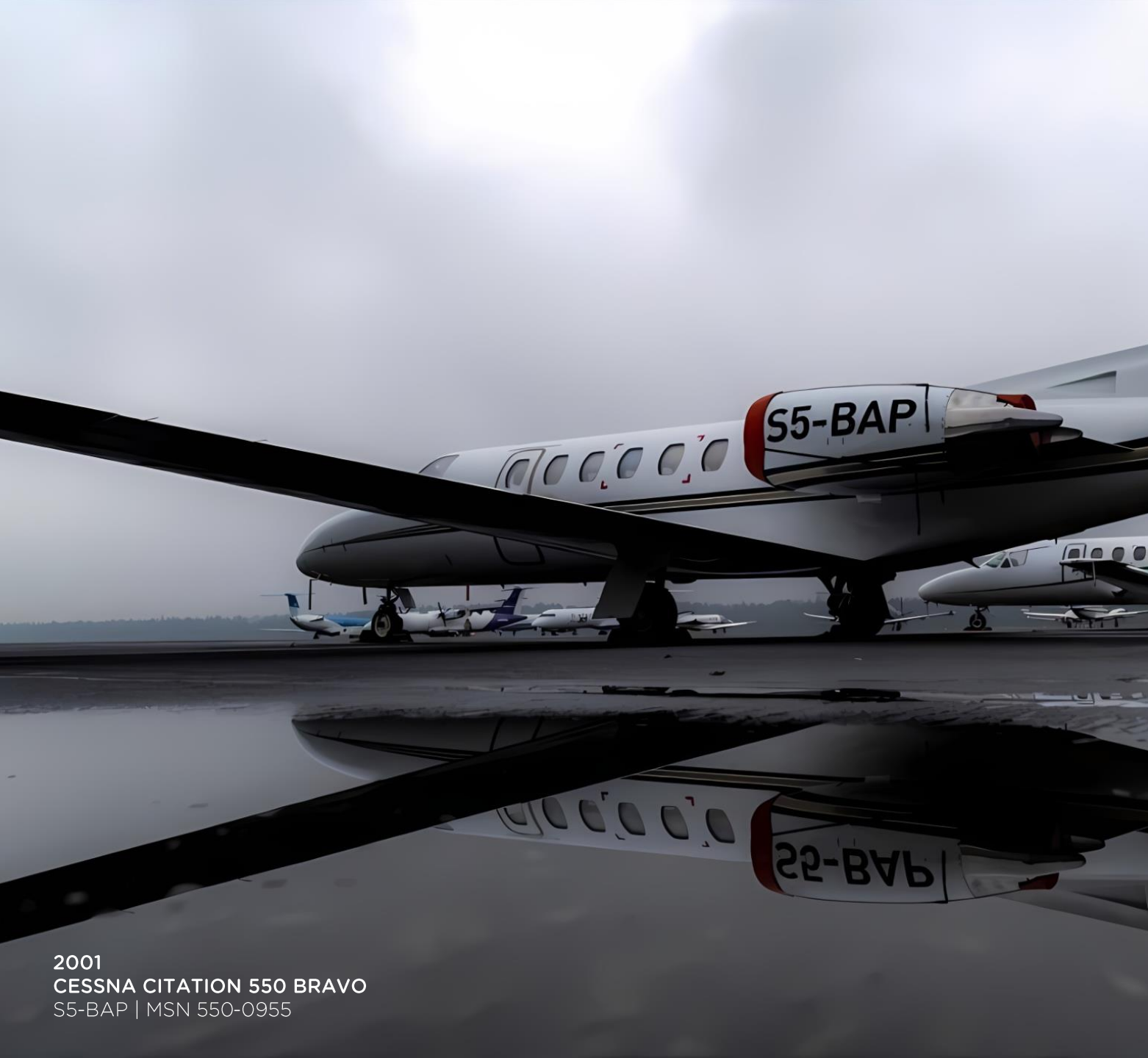
2001 CESSNA CITATION 550 BRAVO S5-BAP | MSN 550-0955