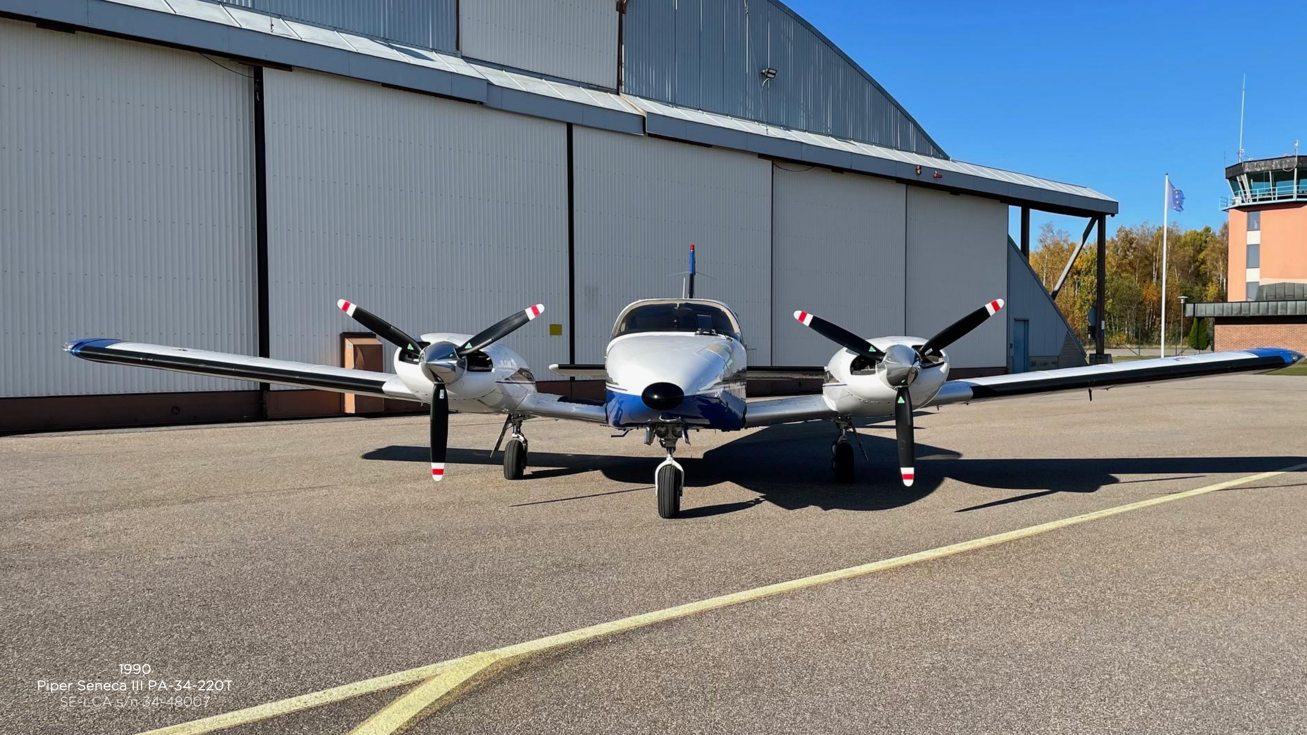
1990 Piper Seneca III PA-34-220T SE-LCA s/n 34-48007