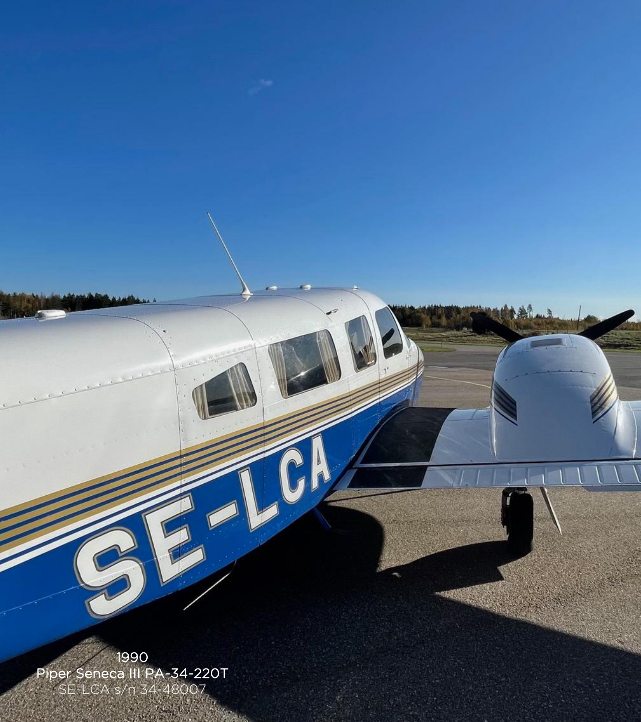
1990 Piper Seneca III PA-34-220T SE-LCA s/n 34-48007