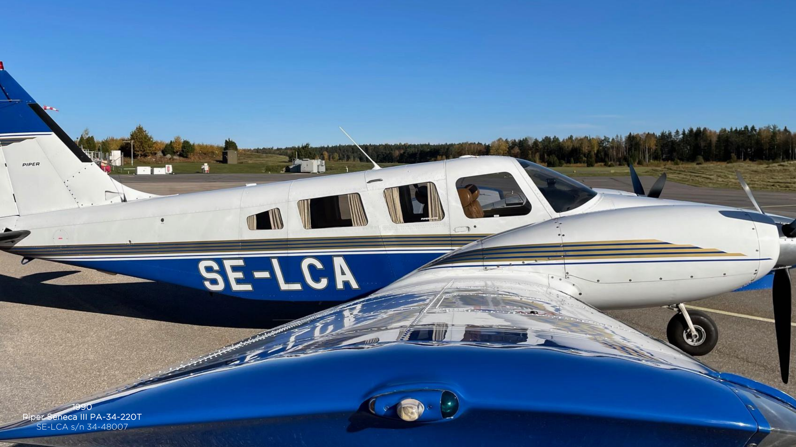
1990 Piper Seneca III PA-34-220T SE-LCA s/n 34-48007