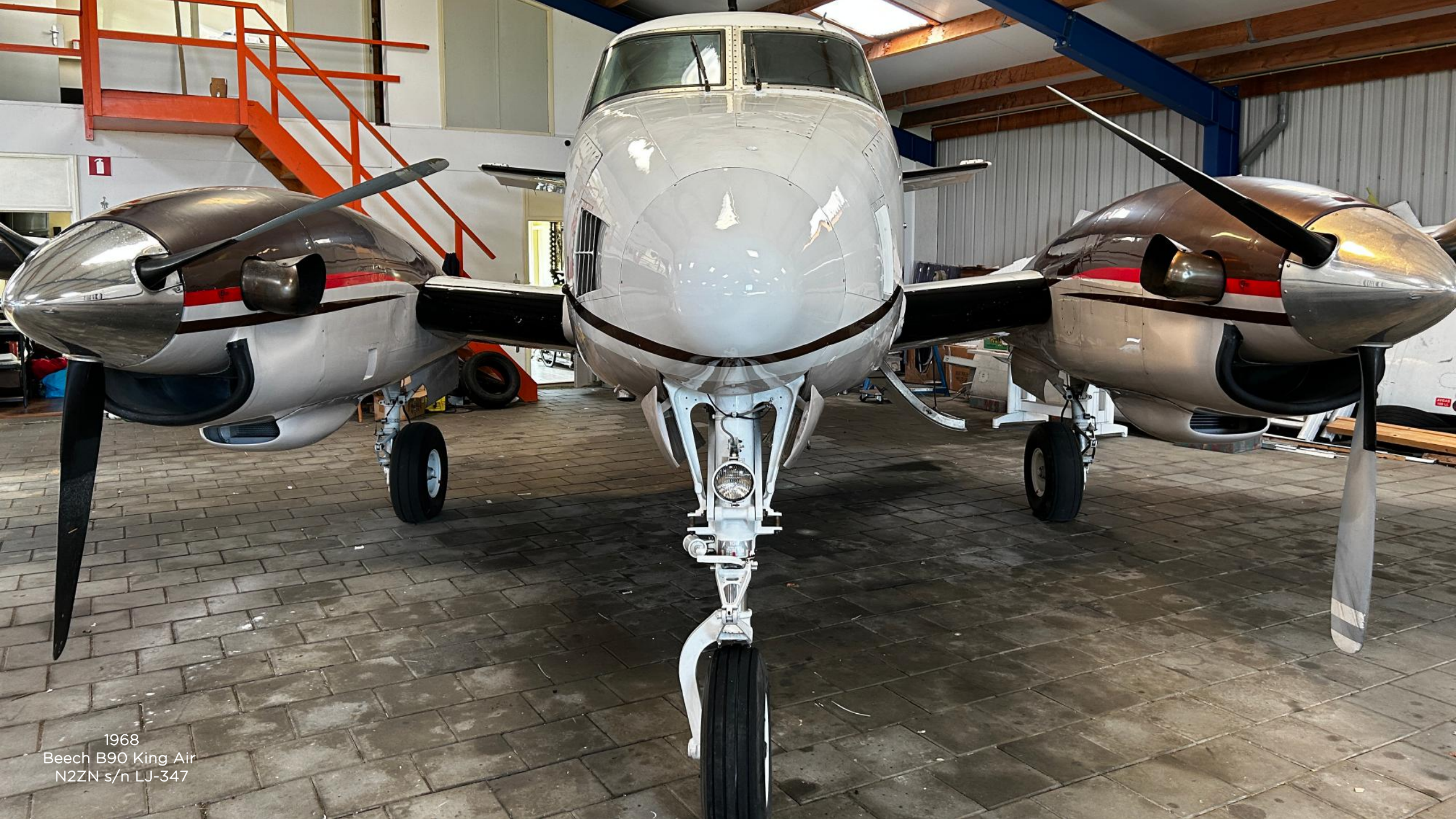
1968 Beech B90 King Air N2ZN s/n LJ-347