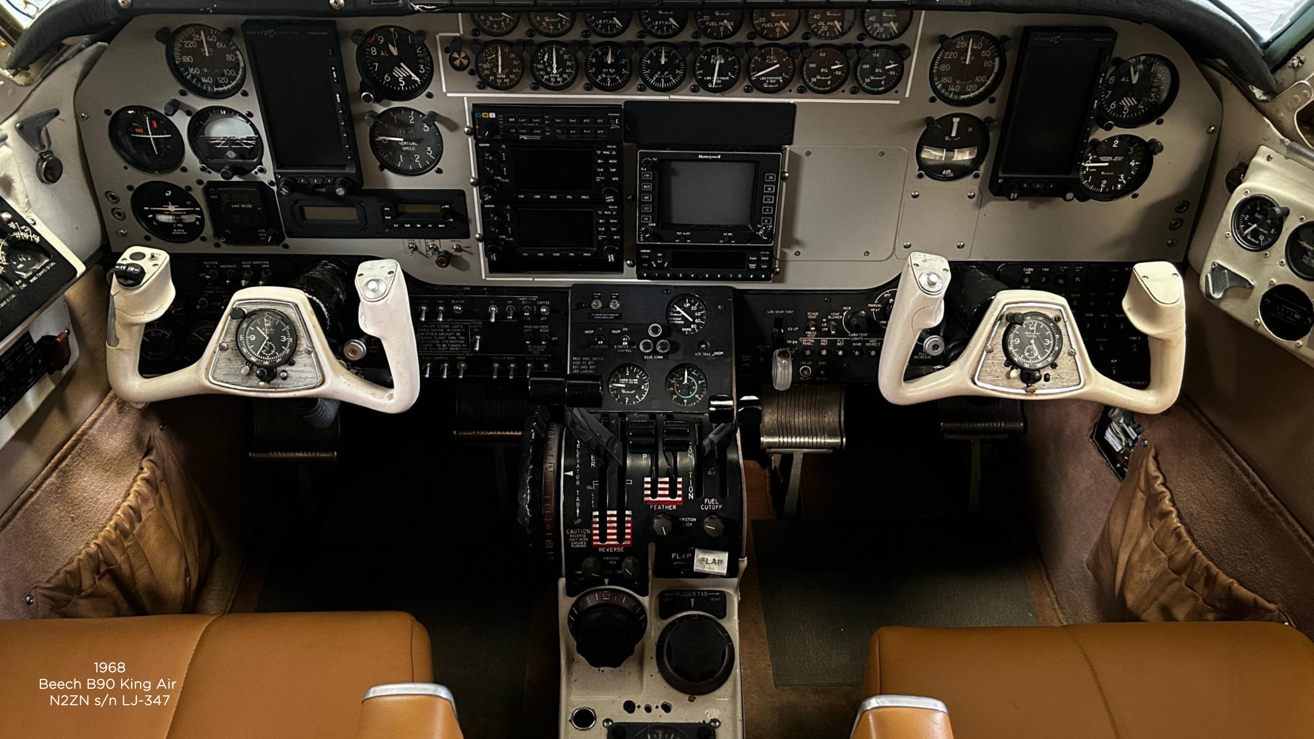
1968 Beech B90 King Air N2ZN s/n LJ-347