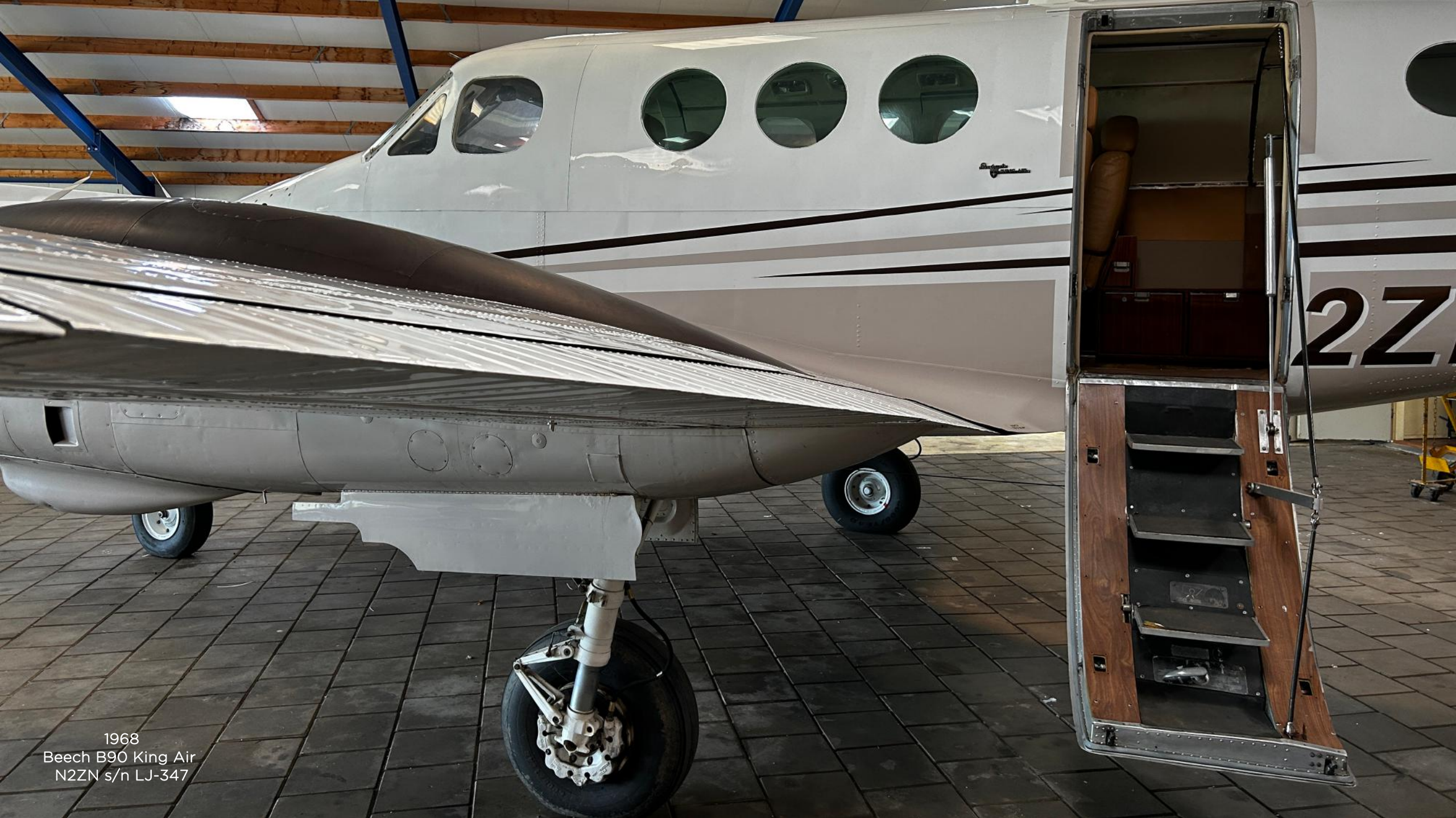
1968 Beech B90 King Air N2ZN s/n LJ-347