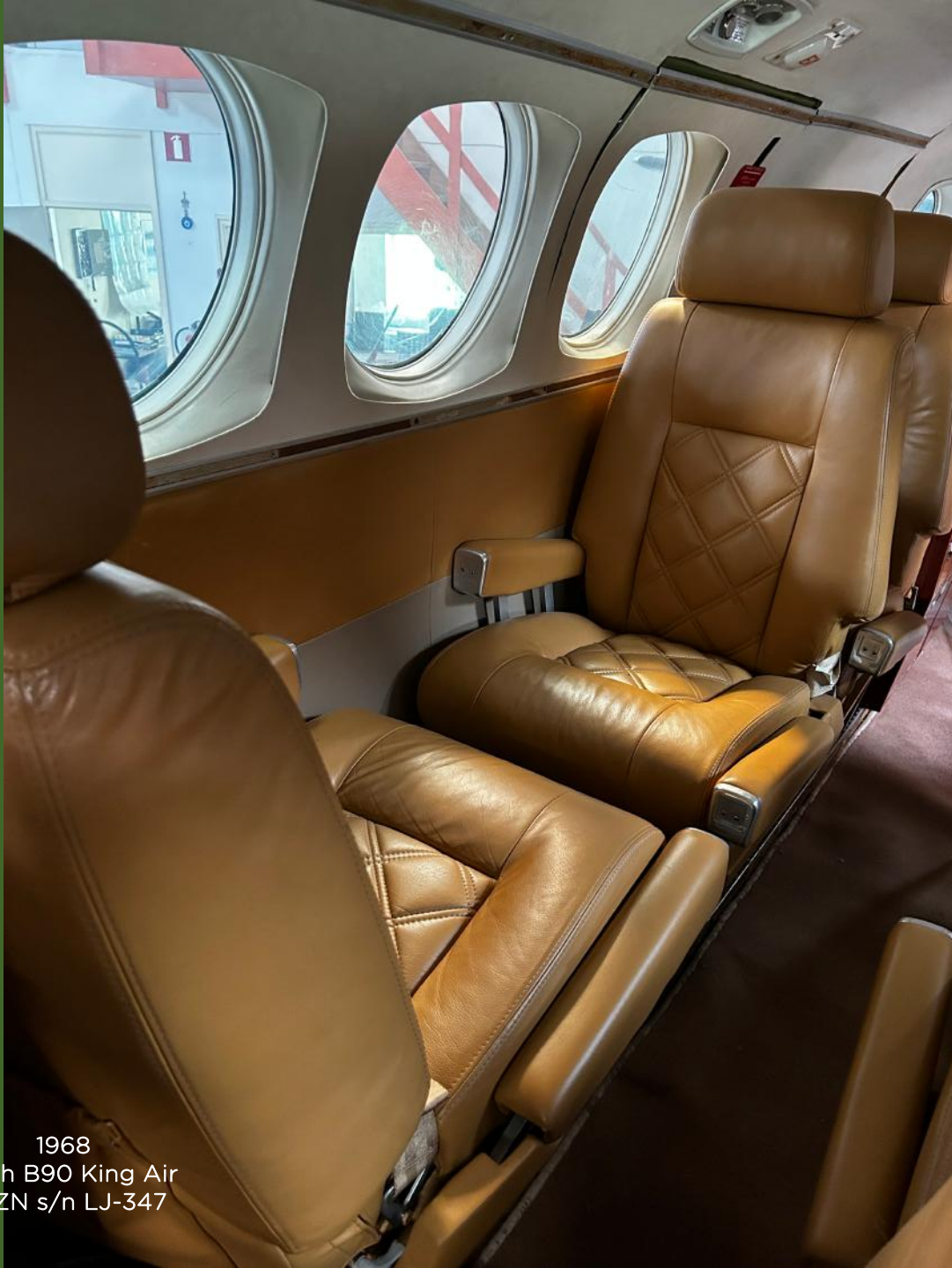
1968 Beech B90 King Air N2ZN s/n LJ-347