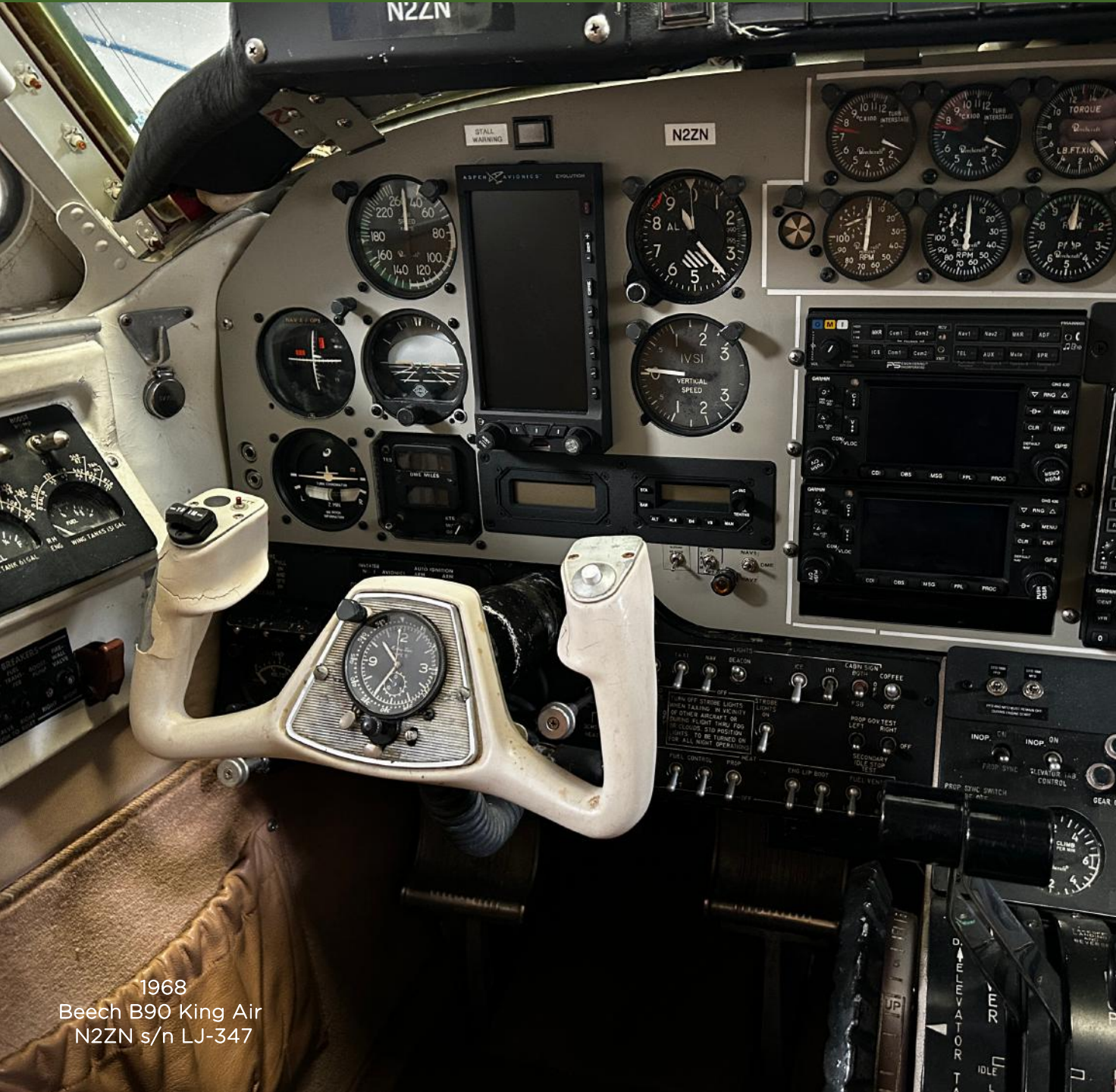
1968 Beech B90 King Air N2ZN s/n LJ-347