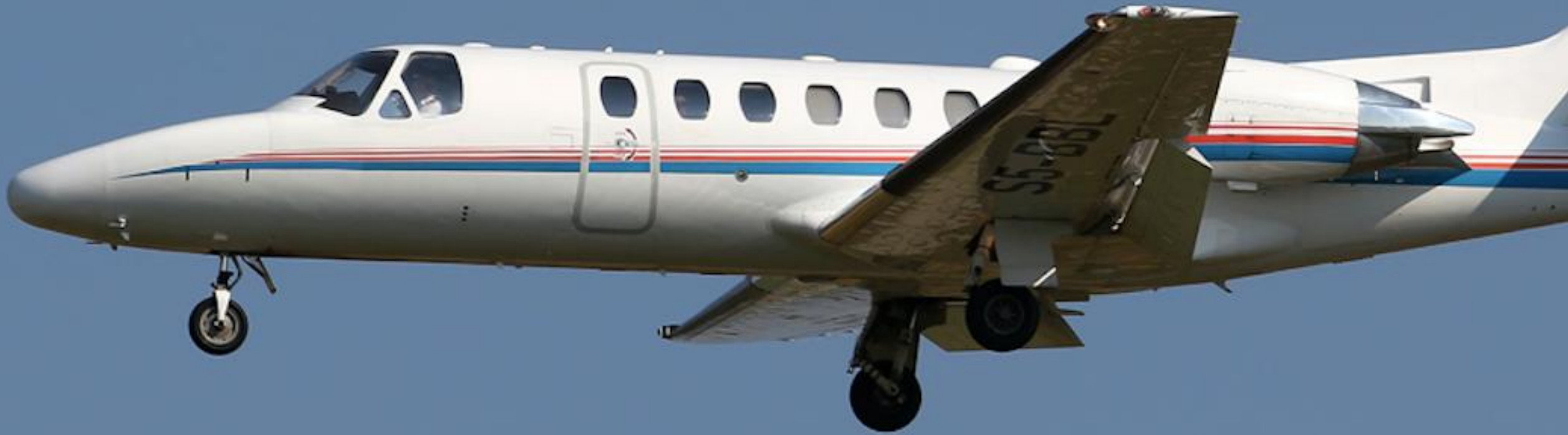
Cessna 550B Citation Bravo S5-BBL s/n 550B-0972

White with blue and orange stripes, paint has been applied in Cessna factory, Wichita, USA