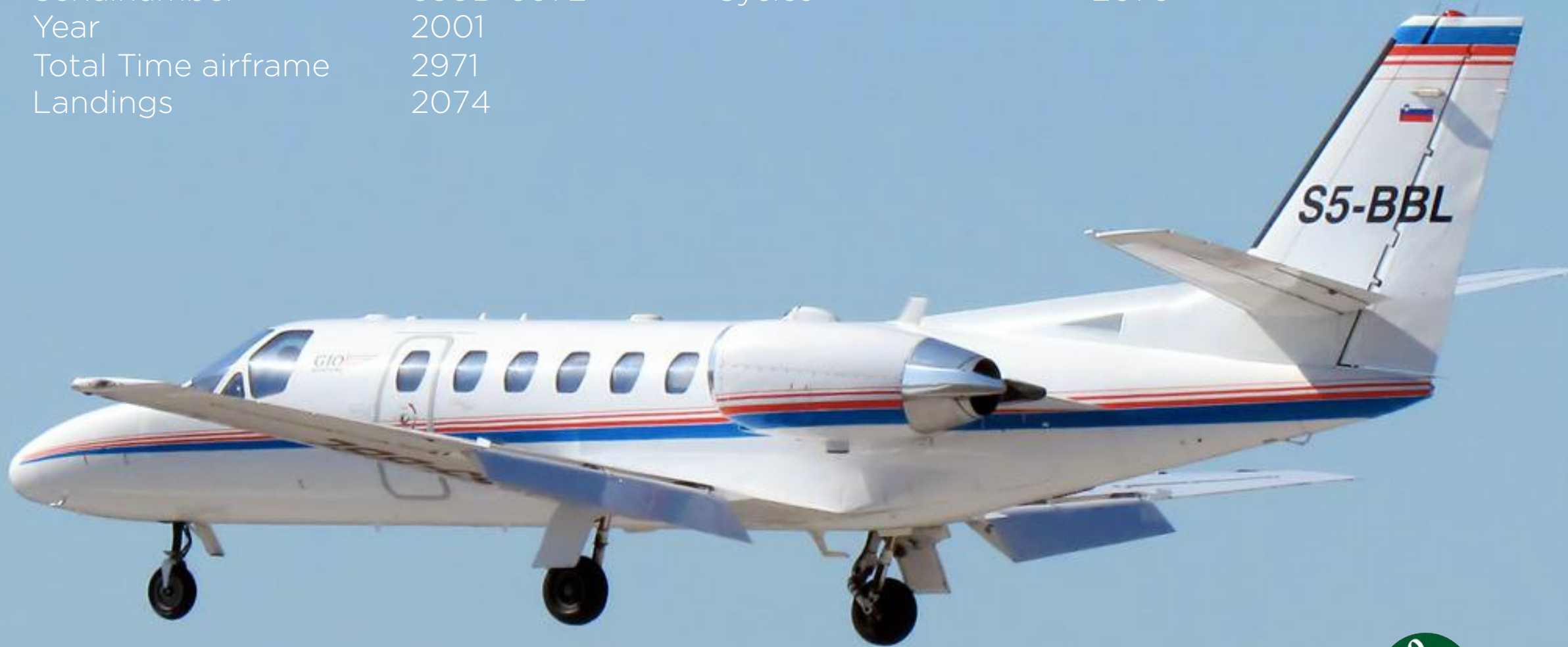
Cessna 550B Citation Bravo S5-BBL s/n 550B-0972

Type PWC 530A Total Time engine 2973 Cycles 2079