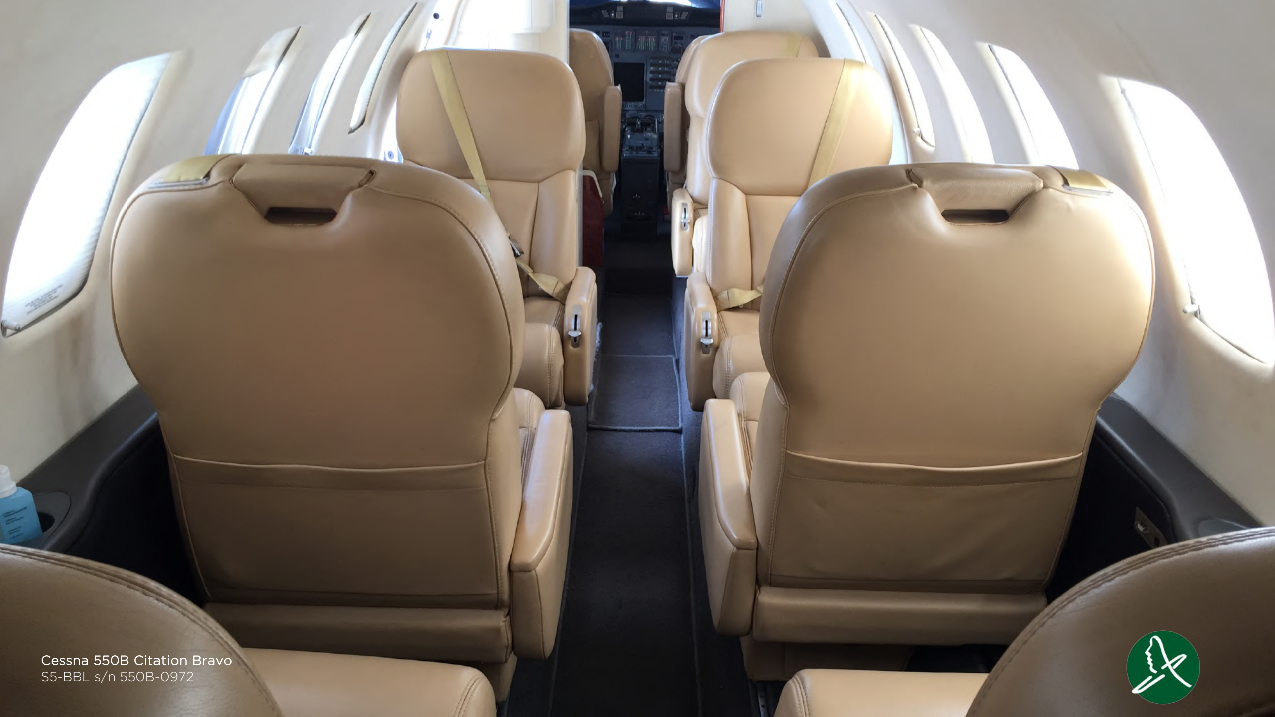
Cessna 550B Citation Bravo S5-BBL s/n 550B-0972