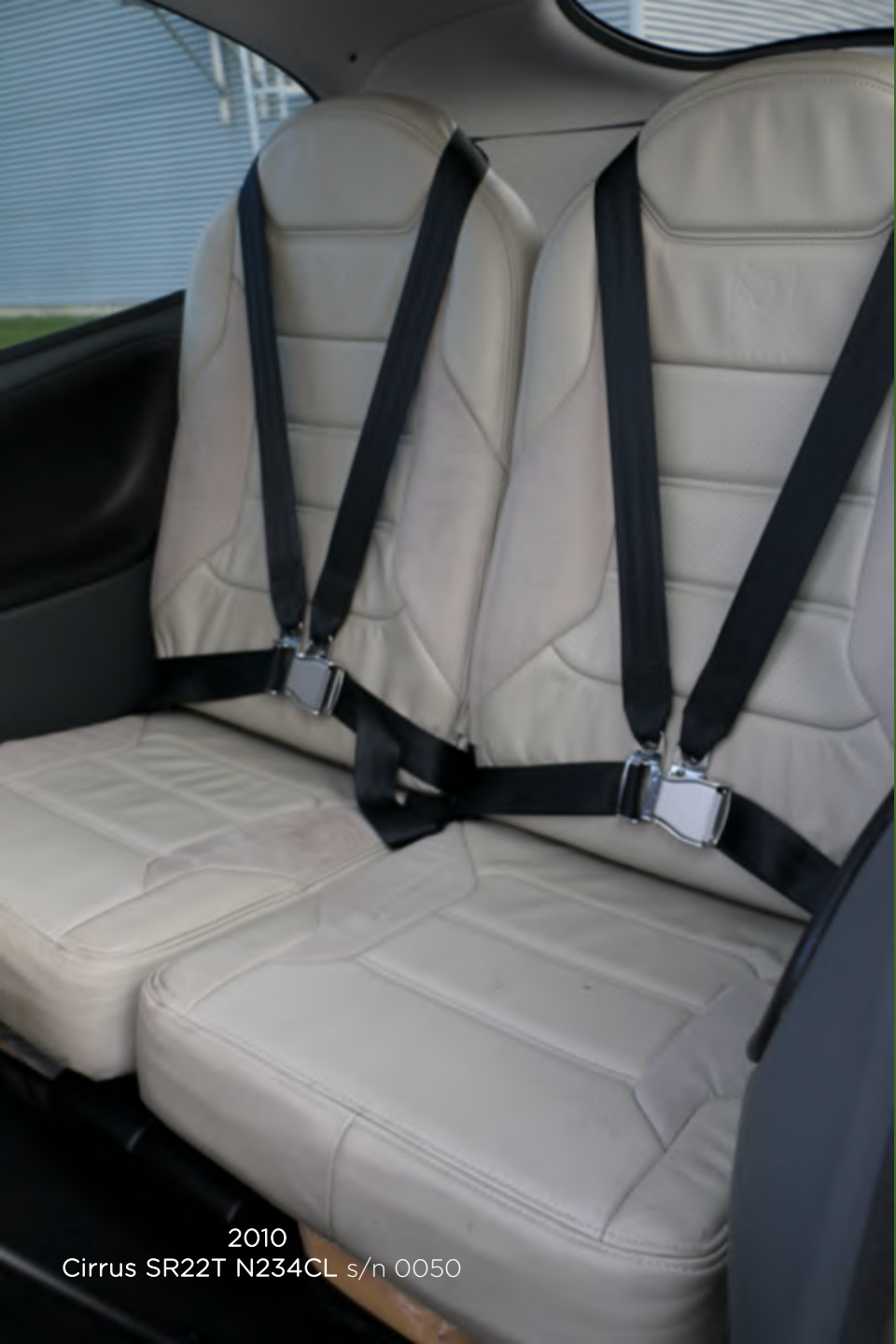
2010 Cirrus SR22T N234CL s/n 0050