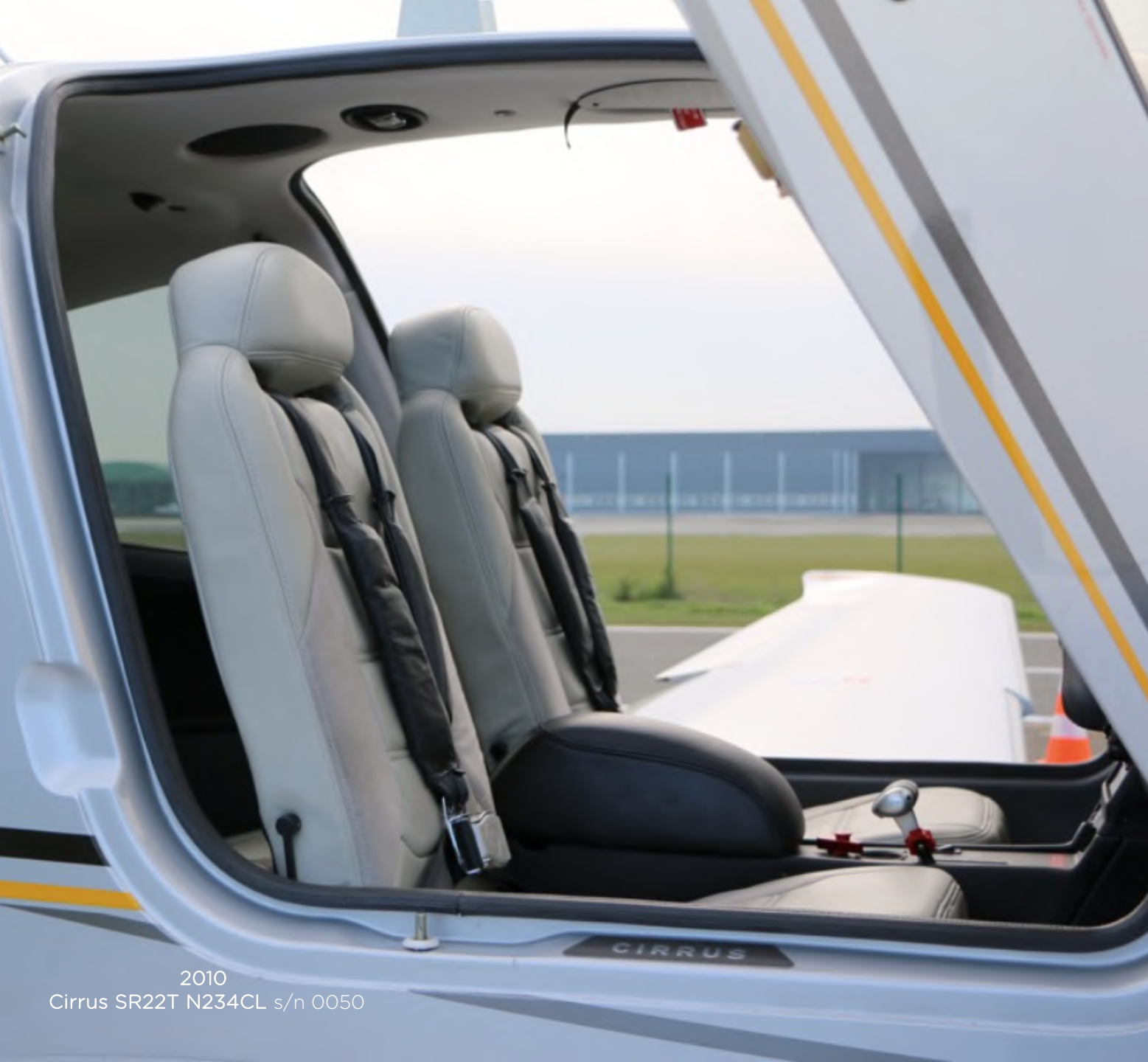
2010 Cirrus SR22T N234CL s/n 0050