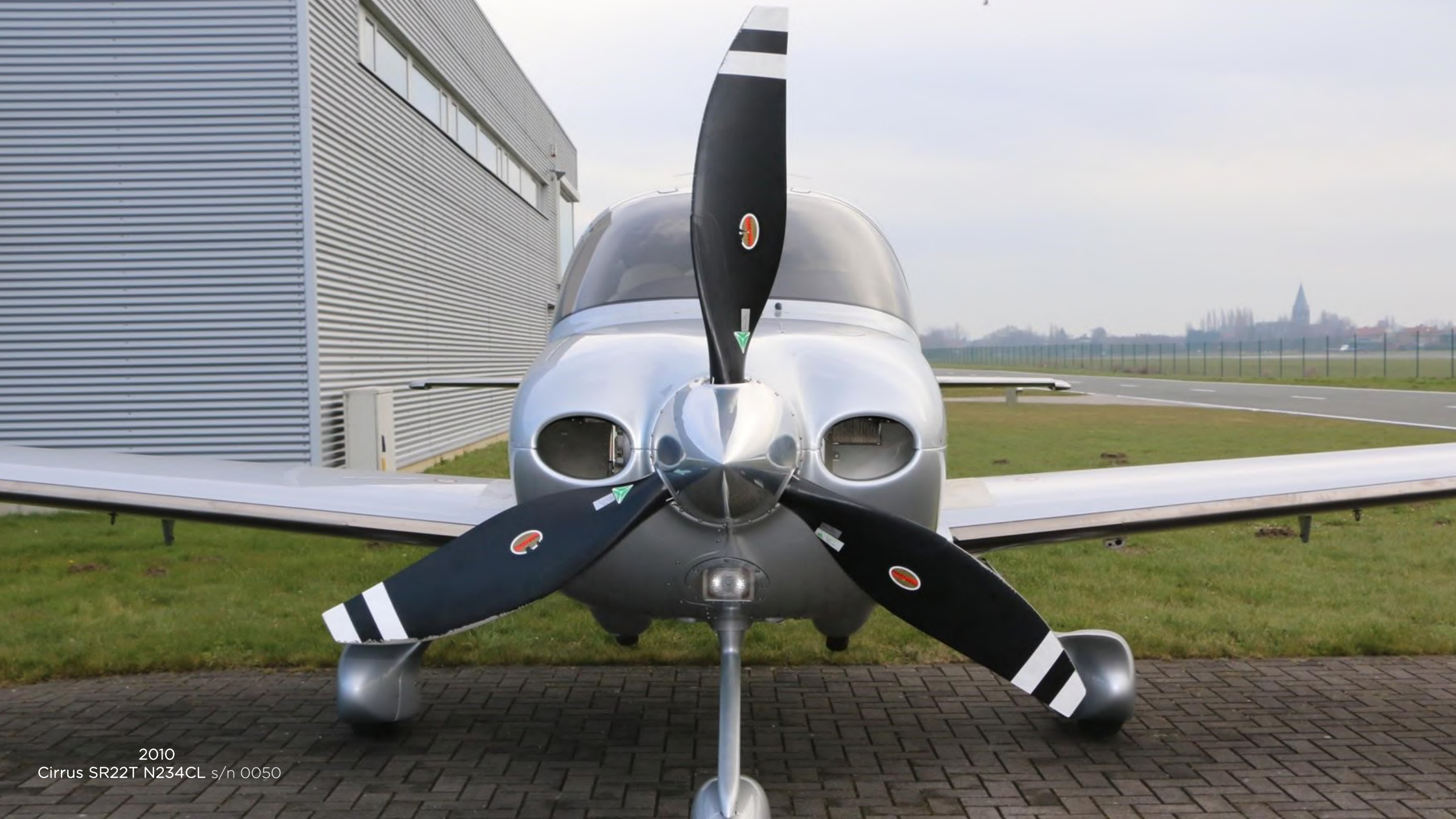
2010 Cirrus SR22T N234CL s/n 0050