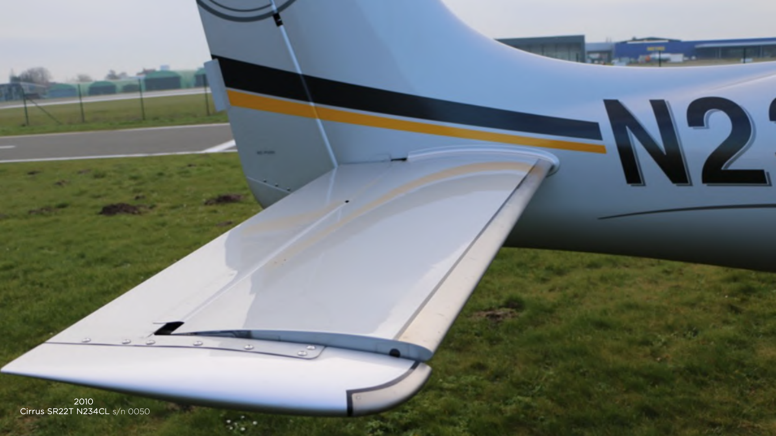
2010 Cirrus SR22T N234CL s/n 0050