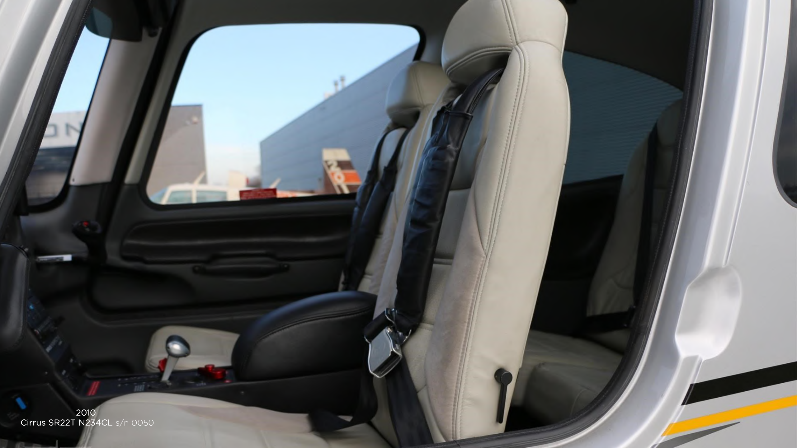
2010 Cirrus SR22T N234CL s/n 0050